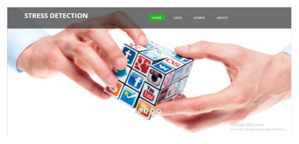
Fig. 2: Home page of stress detection system